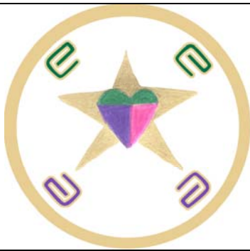
Love & Trust©